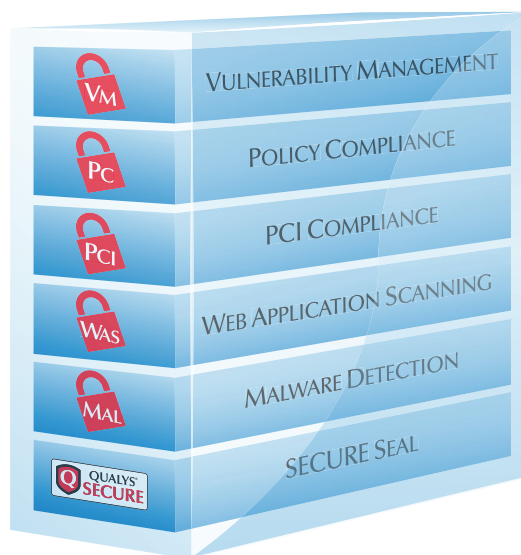
The QualysGuard IT Security & Compliance Suite

Web Site Security Testing Service and Security Seal that Scans for Vulnerabilities, Malware, and SSL Certificate Validation