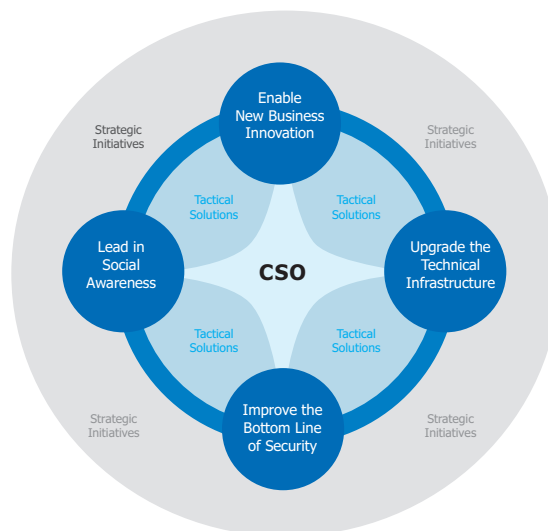
Exhibit 1. Achieving balance between strategic initiatives, tactical solutions, and the dynamics of the business.

IT and security teams are expected to find ways to reduce operating expenses. And the corporate goal of realizing continuous improvements in operational efficiency leads the CISO to seek automated solutions that require less administrative overhead, less invasive products that reduce support costs, and strategies that apply equally to enable new business innovation, upgrade the technical infrastructure, and lead in socially rewarding initiatives. This balance between strategic initiatives, tactical solutions, and the dynamics of the business is represented in Exhibit 1.